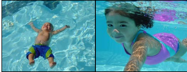
ages 6 months to 5 years

BABY & YOUNG CHILD SURVIVAL SWIMMING LESSONS AT THE MERIDIAN SCHOOL